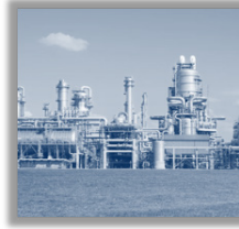
Gas Processing Plants