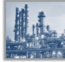
+over 400 other units